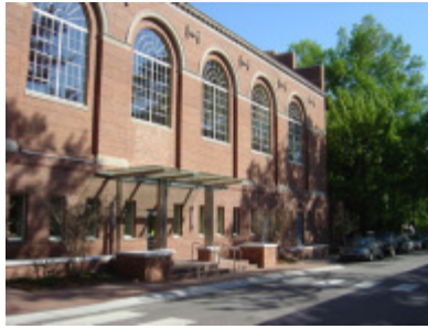
Thompson Hall Craft Center